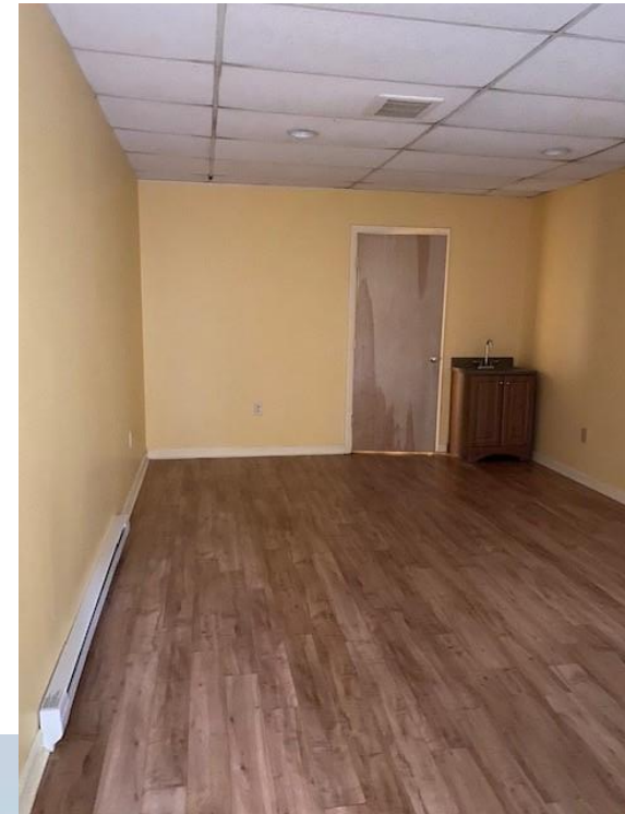
Suite 4 2 nd Floor Office Space