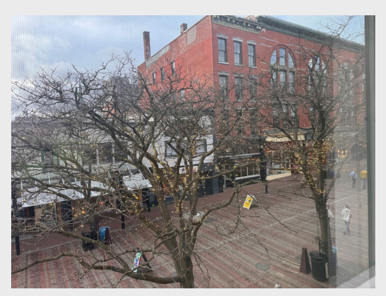
View of Church St from office window